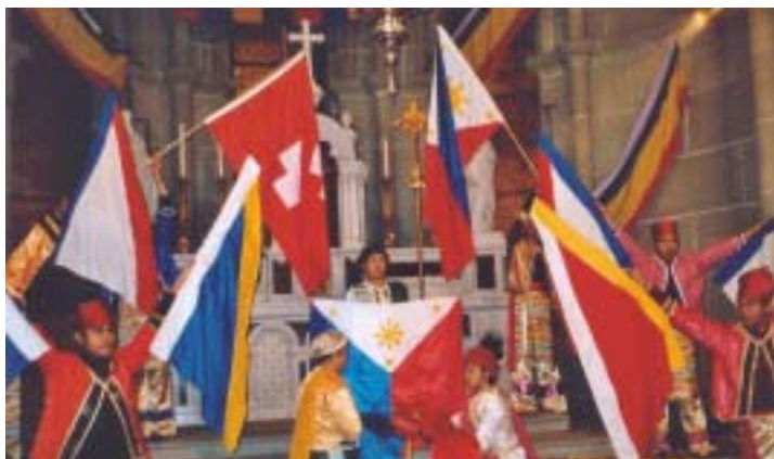
Bright and lively colors fill the St. Peter and Paul's Church in Berne as Teatro presents the history of the Philippines in dances, drama and songs.

The Aglipay Central Theological Seminary (ACTS) Teatro group visited Switzerland to perform at the St. Peter and Paul's Church in Berne on 31 October 2004. Founded in 1999 and composed of 14 seminarians from the Philippine Independent Church (PIC), the group was on its first tour abroad that took them to Sweden, The Netherlands and Switzerland. An enthusiastic Swiss and Filipino-Swiss audience watched Teatro depict the history of the Philippines in dances, drama and songs.