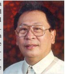
Secretary Alberto G. Romulo